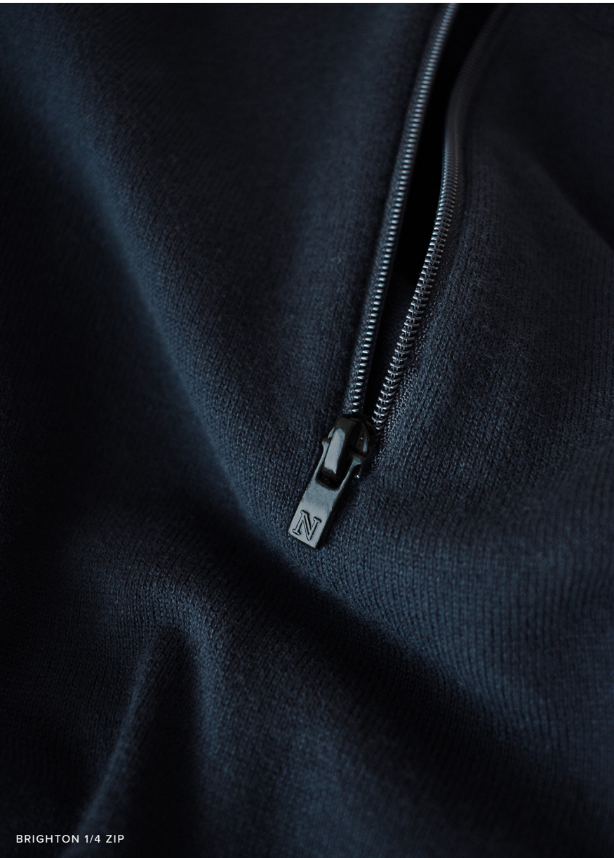
BRIGHTON 1/4 ZIP