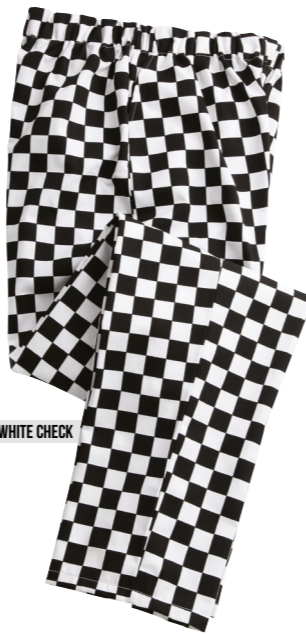
BLACK & WHITE CHECK

PR554 Chef's 'Select' Slim Leg Trousers ■ Fitted style on lower leg, Patch pocket on right leg, Elasticated waist with draw cord and zip fly fastening ■ 65% Polyester, 35% Cotton, 195gsm ■ Sizes: XS/28" – 2XL/44" ■ 1 colour