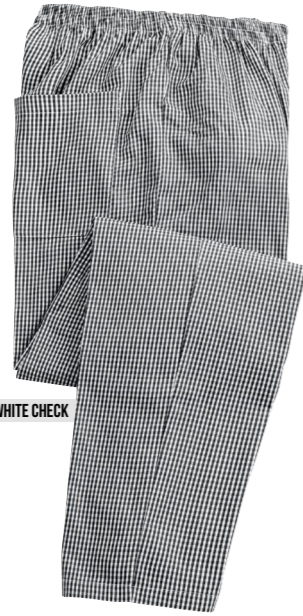
BLACK & WHITE CHECK