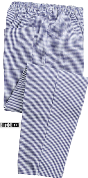
NAVY & WHITE CHECK