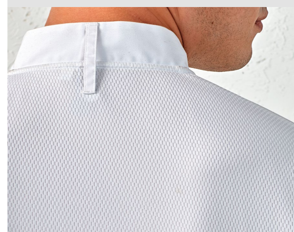
Coolchecker® fabric mesh back panel